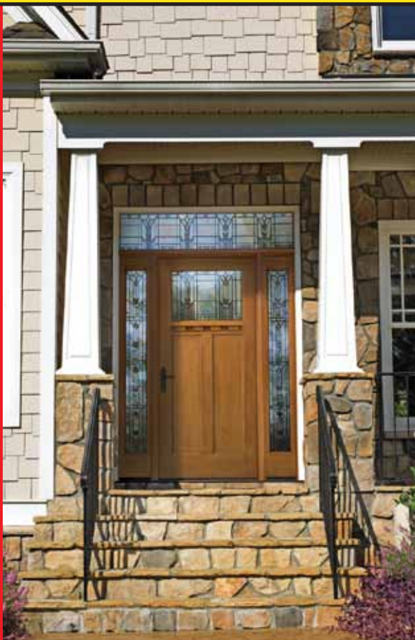
Classic-Craft™ Door Style: CCA214 with 4-block dentil shelf, CCA3404SL sidelites and HART transom - Hazelton™ Glass